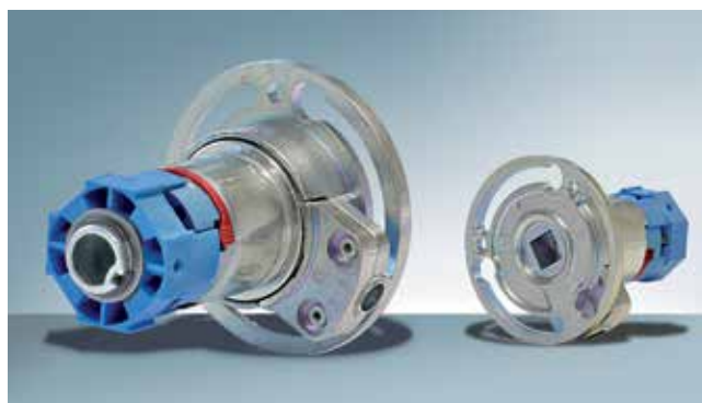
Bevel gear for left and right hand installation