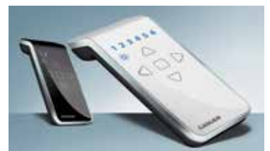
L-Concept handheld transmitter

The complementary functions offer more safety during operation as well as a wider range of applications in the context of the ongoing building automation through an integrated SMI or KNX interface.