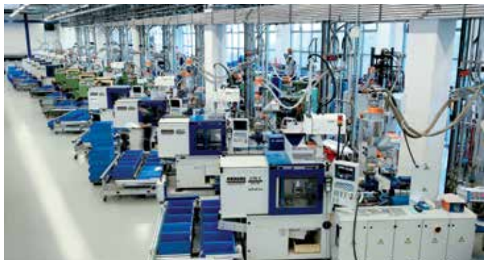
100% GEIGER: plastics technology

Since its foundation, GEIGER has been exclusively producing in Bietigheim- Bissingen, Germany. All business areas are closely related. The high integration of the different sectors, from product development to manufacturing, ensures an optimal interaction from the initial product idea to series production. All processing