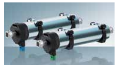
GJ56.. E06 and E07 SMI