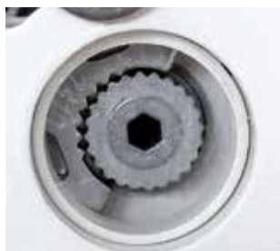
Picture 1: The teeth are on top of each other.

► When adjusting the end stops, it may happen, for technical reasons, that the teeth are placed on top of each other. To avoid this situation, the awning must be retracted approx. 1 or 2 cm.