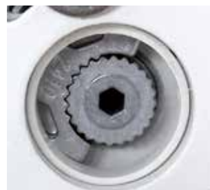
Picture 3: Tightening the screw in order to fix the gearing.