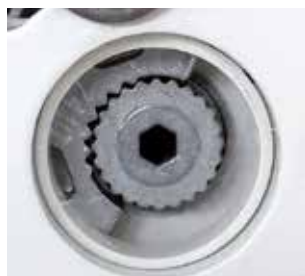
Picture 2: Retract the awning in order to have the teeth fit into each other.