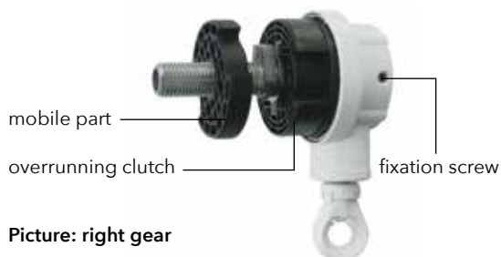
Picture: right gear

Make sure that the mobile part is in contact with the overrunning clutch. When assembling the right gear version, rotate clockwise until the mobile part is in contact with the overrunning clutch. When assembling the left gear version rotate counter clockwise until the mobile part is in contact with the overrunning clutch.