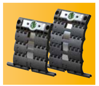
Available with 2 or 3 elements for mini and maxi profiles.