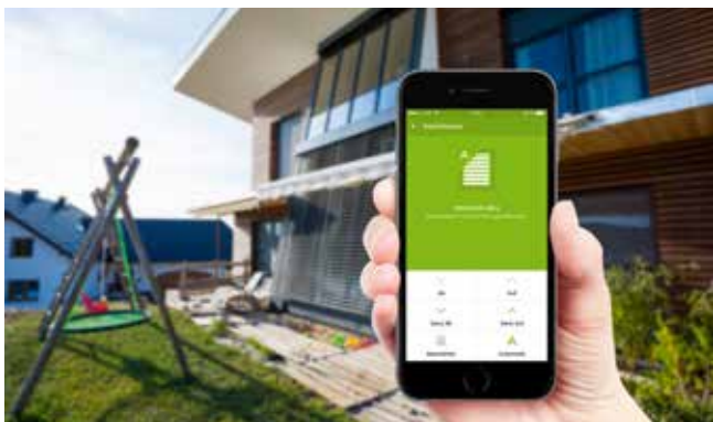
Control your Smart Home from anywhere: via PC, tablet or smart phone, with free app.

"I'd better start with the mounting. It was a neat job! Everything is radio-controlled: no need to lay any cables to the switches. And with the mesh technology the many concrete walls in my house were no problem for the radio signals."