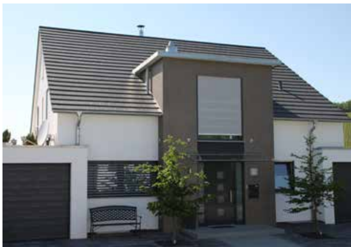
Automatic shading: determination of longitude / latitude coordinates, window orientation and integration of additional weather data.