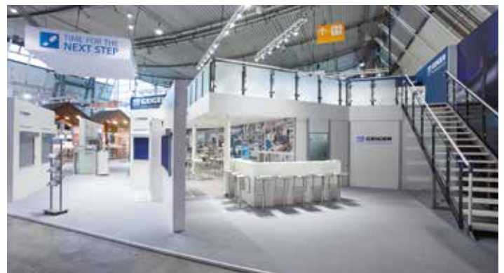
The new booth design attracted considerable attention.