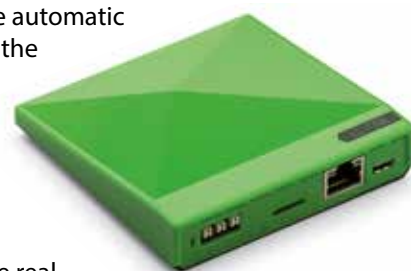
The Loxone Miniserver Go is the heart of the Smart Home.