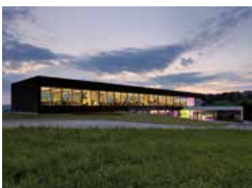
Loxone basecamp Kollerschlag, Upper Austria

Ö: The sun protection in private homes will be networked with lighting, heating, alarm, and much more – controlled and automated with highest precision through a centralized solution. That is what we already experience in a Loxone Smart Home. Together with GEIGER we will further expand our pioneering role in the control and automation of the sun protection.