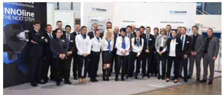
More than 30 staff members provided customer support.

The R+T Turkey takes place in November 2015. The GEIGER products will also be presented.